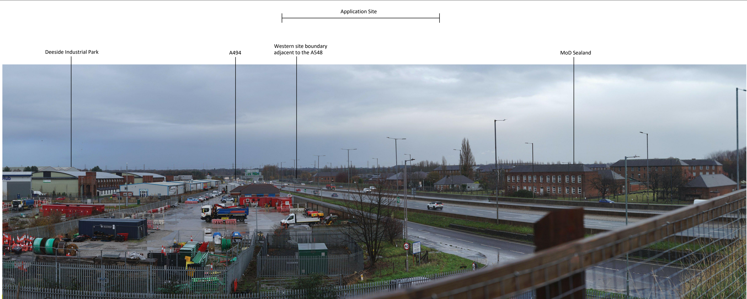
VIEWPOINT 4: View towards the Application Site from the Chester Millenium Greenway bridge