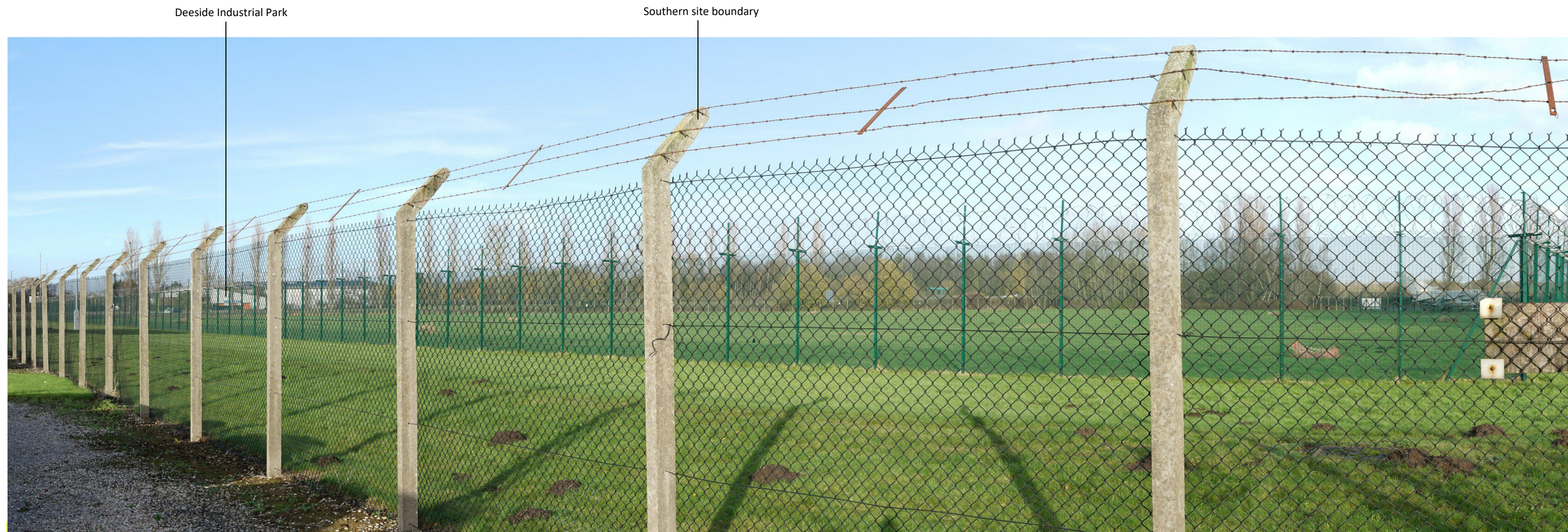
VIEWPOINT 1: View towards the Application Site from within the MoD Sealand site