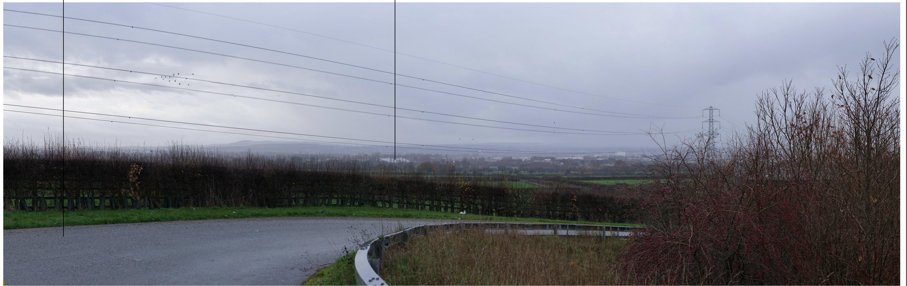
VIEWPOINT 6: View towards the Application Site from Bridleway 267/3/1 Shotwick Park 3