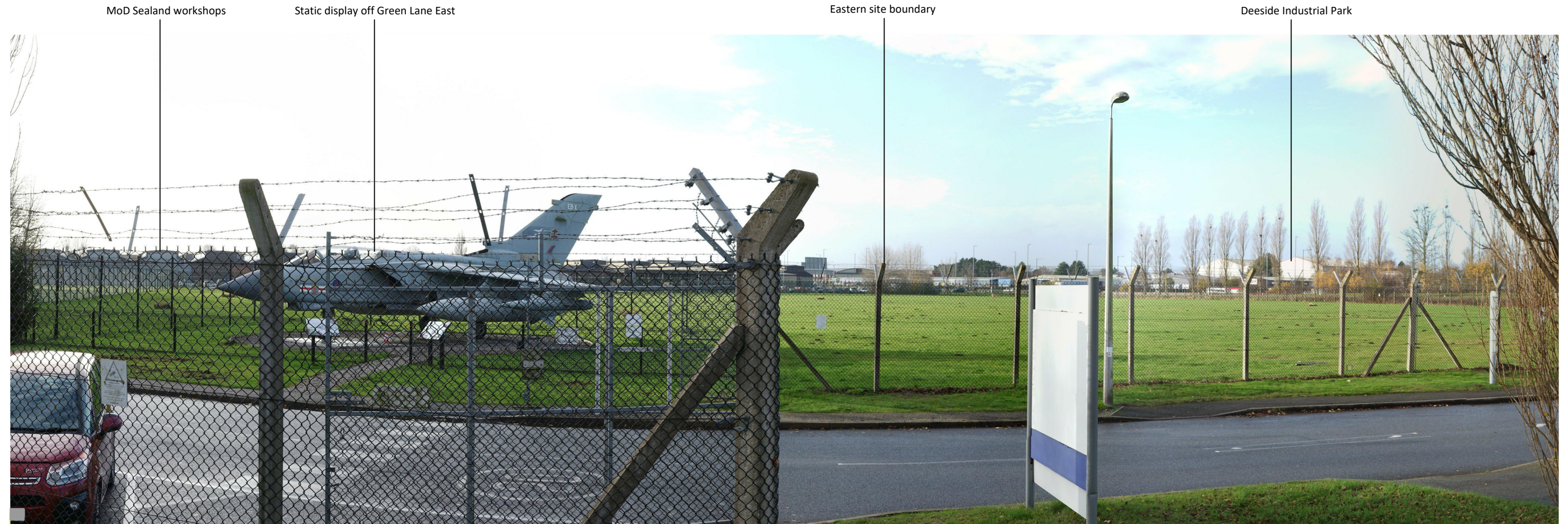
VIEWPOINT 2: View towards the Application Site from Green Lane East / Bridleway 309/7/20