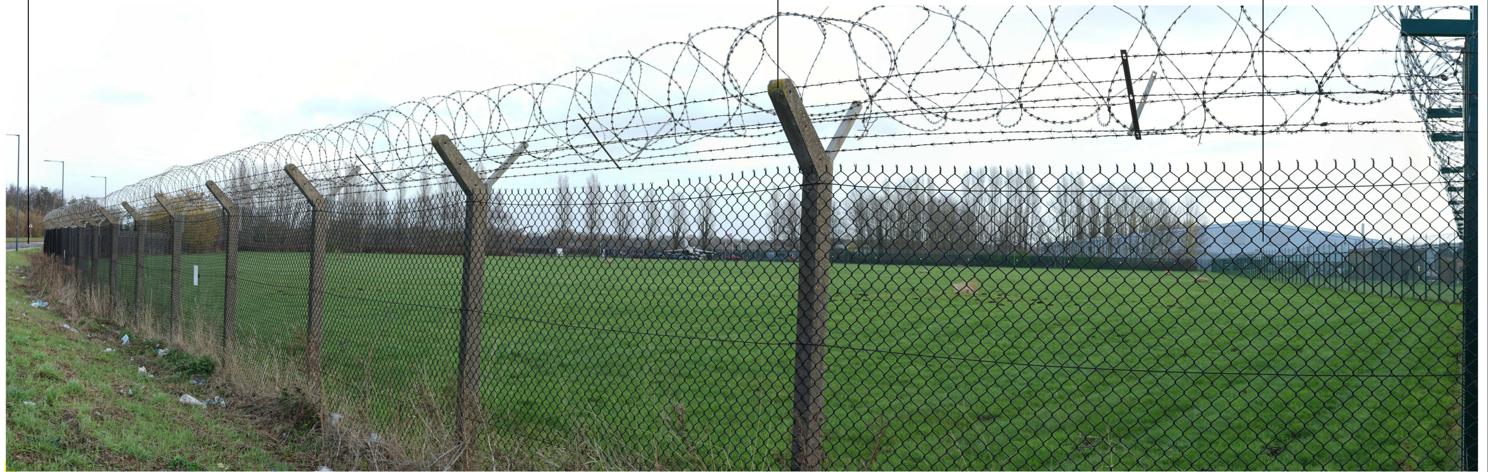
VIEWPOINT 3: View towards the Application Site from the footway adjacent to the A548